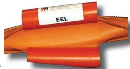
MODEL # EEL