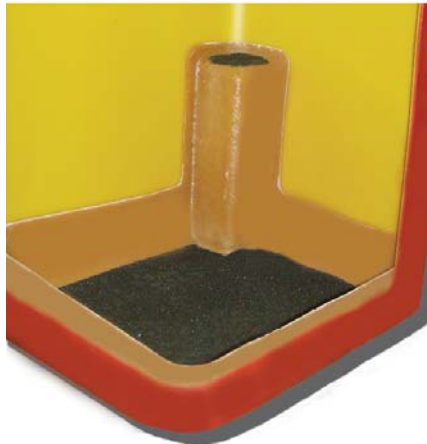
Scuff Pad shown inside insert

Standing in the basket with your back to the boom. Note the A# places the step in the upper right or lower left corner.